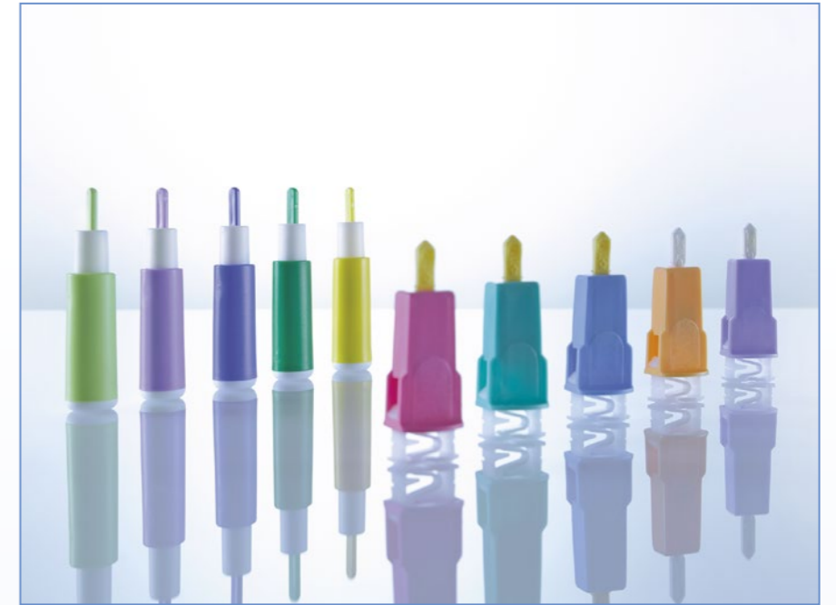
Lancets are colour-coded for easy identification of puncture depth and application.

The safety mechanism ensures that the blade/needle is automatically retracted after the puncture and is safely enclosed within the plastic housing. In particular when dealing with our youngest patients it is imperative that the procedure be as gentle as possible to avoid causing unnecessary anxiety. The safety mechanism means that the blade/needle is hidden from view, allowing the blood collection to take place in a more relaxed atmosphere for all concerned.