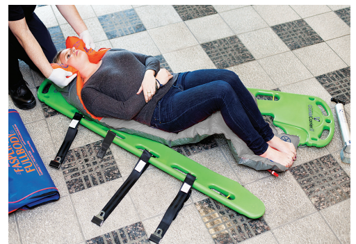
Can Be Easily Separated At Either End